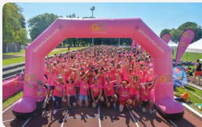
The initiatives encourage children to stay fit and healthy

INEOS Chairman Sir Jim Ratcliffe himself is also involved in some film making, namely the