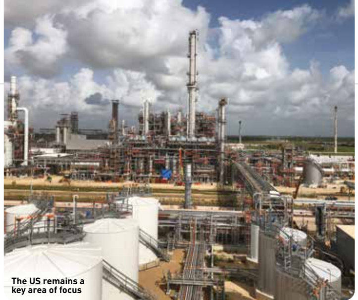
The US remains a key area of focus

Late last year, INEOS Enterprises added the chemical intermediates business of Flint Hills Resources and also agreed to buy the entire composites business from Ashland Global Holdings for $1.1bn. The former Flint Hills Business, which manufactures isophthalic acid, trimellitic anhydride and maleic anhydride at a plant near Chicago, Illinois, is now trading as INEOS Joliet.