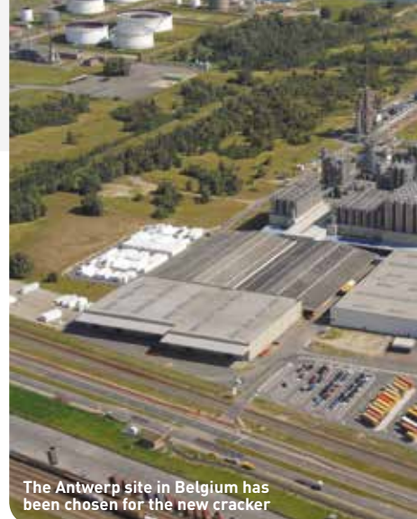
The Antwerp site in Belgium has been chosen for the new cracker

INEOS is undertaking a massive expansion programme in Europe, driven primarily by the need for a dependable and sustainable supply of feedstock